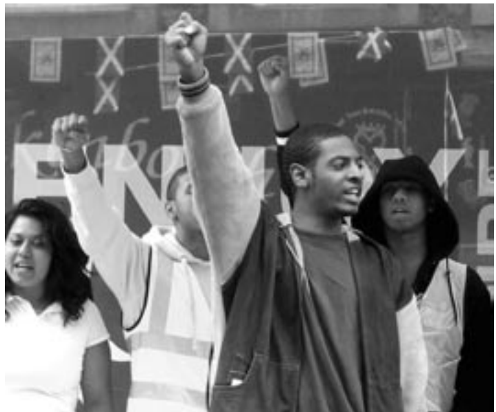
BAA theatre students participating in street performances in Edinburgh.