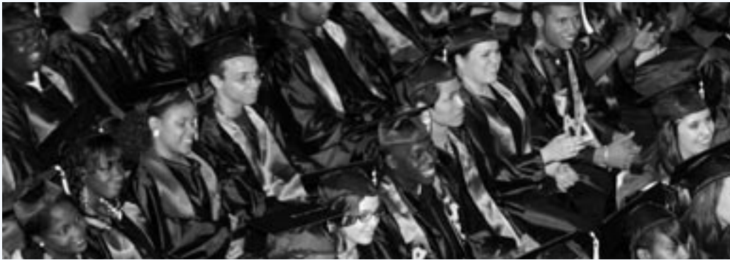
Members of BAA's 2006 graduating class at our commencement ceremony at Symphony Hall

Planning for college begins tonight! Families and students should attend this important meeting to learn about deadlines and application requirements for college enrollment. Local college representatives will be on hand to answer questions.